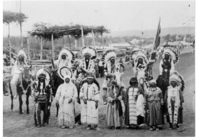
WOOD MOUNTAIN STAMPEDE 1930