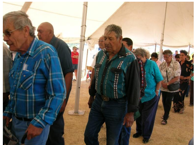
ELDERS IN THE GRAND ENTRY AT POWWOW 2007