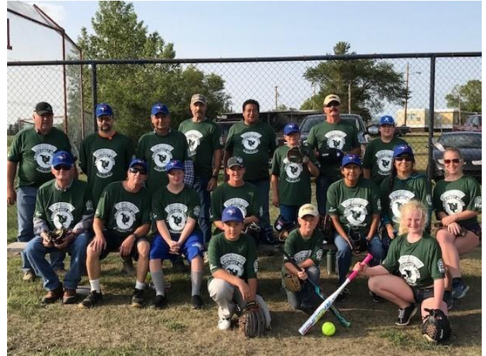
WOOD MOUNTAIN ROOKIE LEAGUE BASEBALL TEAM 2018

Okanese First Nation scored the most points in our league.