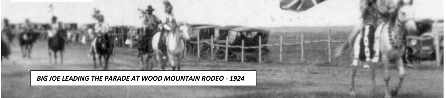
BIG JOE LEADING THE PARADE AT WOOD MOUNTAIN RODEO - 1924